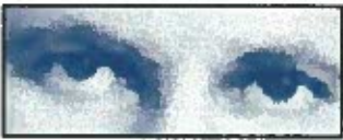
Martin Gruenberg 2005 (acting chmn.)